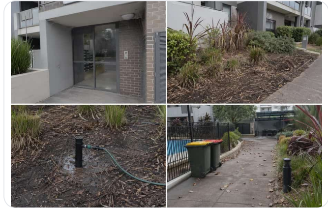
Garden bed presentation before service