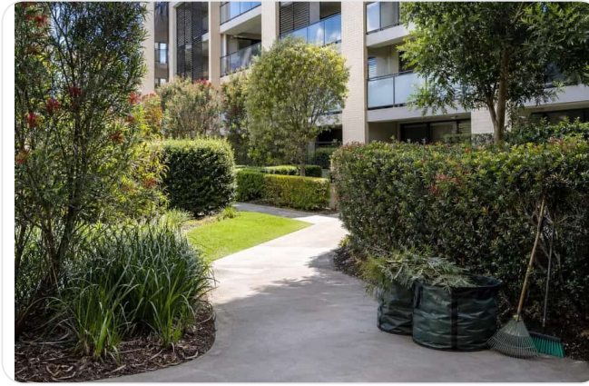
Primary bed restoration underway