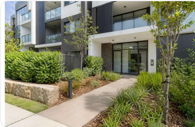
Front entry after completion