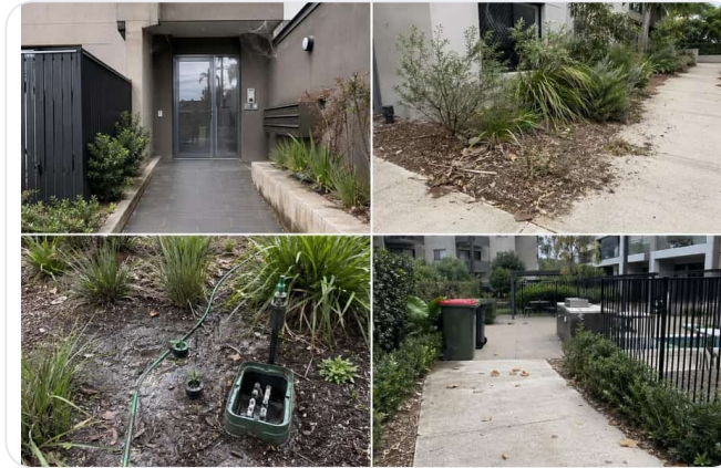
Front entry condition on arrival