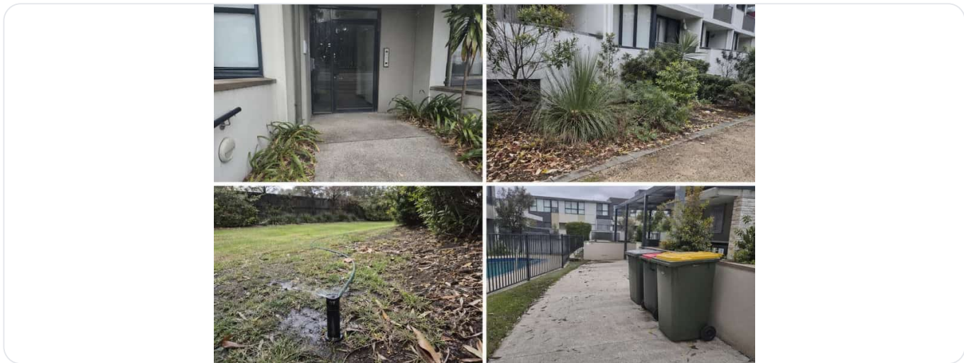
Resident access path before clean-up