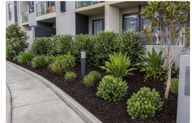
Bed edges and mulch finish