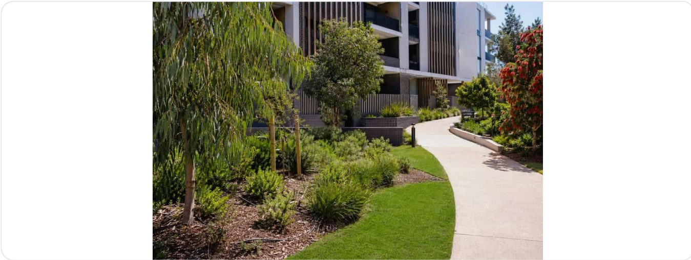
Mid-service presentation check