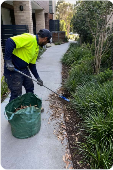
Primary bed restoration underway