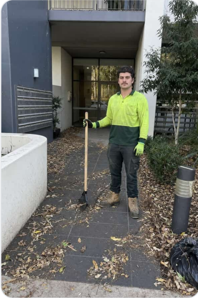
Front entry condition on arrival