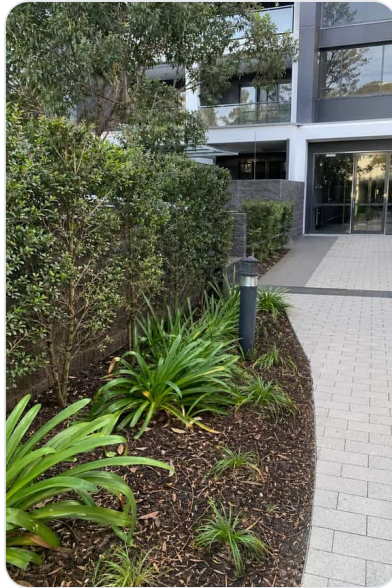
Mid-service presentation check