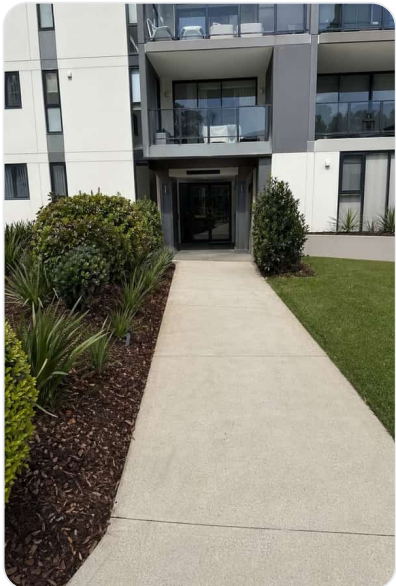
Front entry after completion 11:08 am