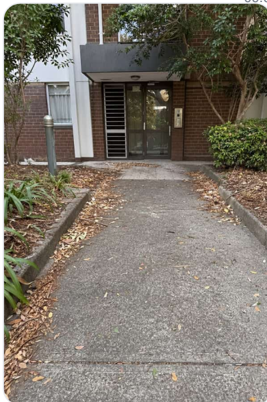
Resident access path before clean-up