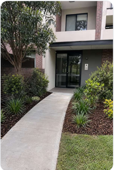
Bed edges and mulch finish 11:15 am