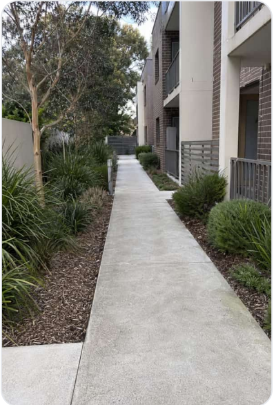
Resident path clear at departure 11:23 am