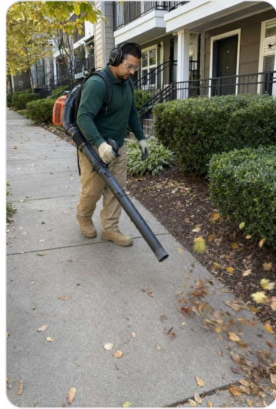
Paths and edges being reset