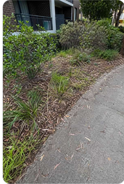
Garden bed presentation before service